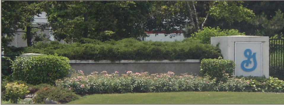
General Mills today

life, while growing and advancing its business model, by fueling the local labor force with quality jobs, providing critical sales tax revenue, and enriching community life through its support of local service clubs and programs.