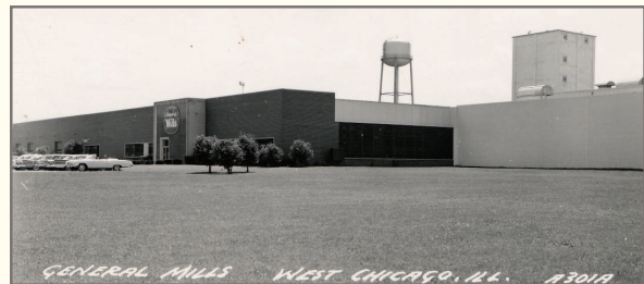
General Mills, circa 1960

The Fortune 500 company, which has its headquarters in Minneapolis, chose the site at 704 West Washington Street in 1959 to open a packaged food production plant. Since that time, General Mills has contributed to the fabric of community