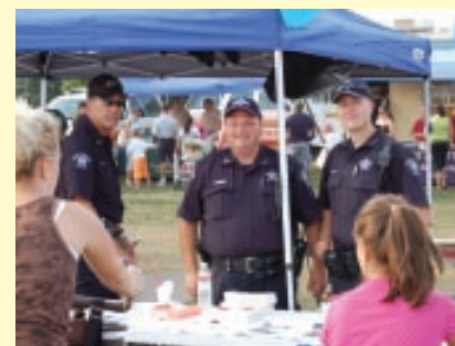
2009 National Night Out

The City of West Chicago will join neighborhoods nationwide on Tuesday, August 3, 2010 , in hosting its own National Night Out . The event is an annual tradition that celebrates the success of communities' crime, drug and violence prevention programs.