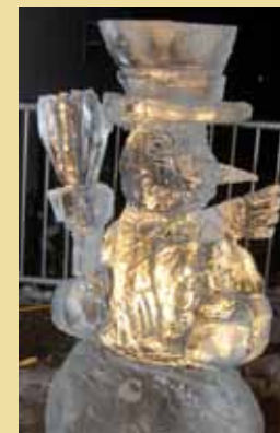
Ice sculpture by Joseph Gagnepain made possible by the West Chicago Public Library and Buck Services, Inc.

Because of everyone's efforts, children and their families delighted in horse-drawn sleigh rides, live music, free refreshments and so much more. View a Frosty Fest slide show at www.westchicago.org .