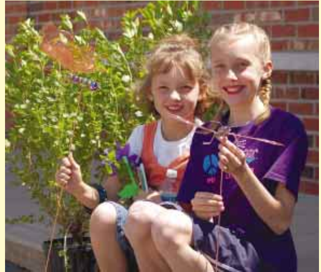
Two young visitors at last year's Blooming Fest take a break to admire their purchases. Garden crafts are being sought for this year's event.

Blooming Fest is a signature event for West Chicago and draws thousands of people from many surrounding suburbs. It is presented by the City of West Chicago, in cooperation with the West Chicago Park District and various community groups and individuals. The 2009 Vendor Registration form is available at www.westchicago.org in the Community Events section, or by calling Krista Coltrin at (630) 293-2200 ext. 135. A musical slide-show of last year's West Chicago Blooming Fest may also be found on the website.