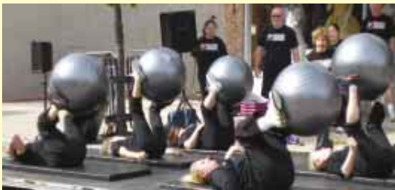
Group exercise takes center stage at this year's Blooming Fest compliments of the Fitness Station.

District 33's efforts dovetail with fitness initiatives of the West Chicago Park District . The Fitness Station, at 103 W. Washington Street, provides residents with a downtown destination for getting into shape. State-of-the-art exercise equipment and expanded fitness classes offer a range of cardio workouts, resistance training and martial arts at a reasonable cost. Exciting programs like Adventure Boot Camp, Zumba and Drums Alive are designed to appeal to a wide range of interests and exercise levels.