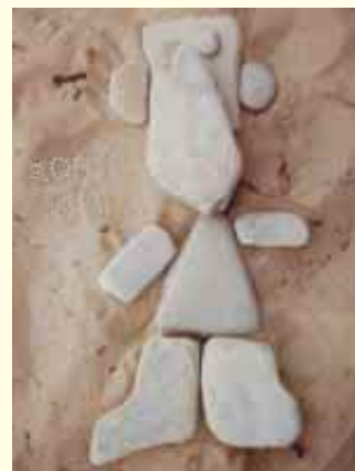
Cecily Herby's photograph Rock On was 2008 "Picture This" winner.

For the second consecutive year, Gallery 200 is pleased to sponsor the "Picture This" Kids Photo Contest . Students currently in first