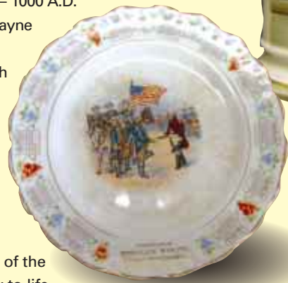
Left: Ceramic plate given as a premium to customers of Herman Wolff who ran a general store on Washington Street in the early twentieth century.